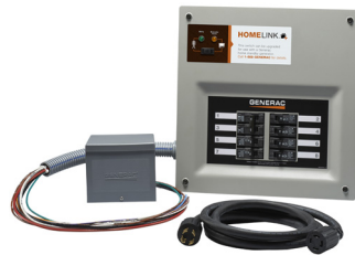
30 AMP Pre-wired Switch Kit Model 6853