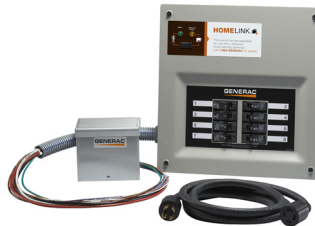
30 AMP Pre-wired Switch Kit Model 6854