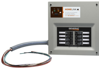
30 AMP Pre-wired Switch Model 6852