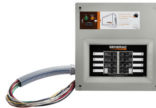
50 AMP Pre-wired Switch Model 9854