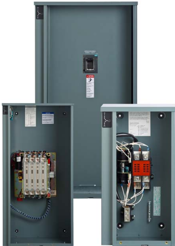
Covers have been removed for illustration.